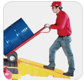
Poly spill pallet ramps make it easier to move large articles