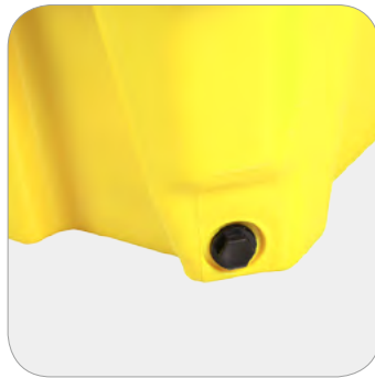
Hexagonal drain plug facilitates drainage