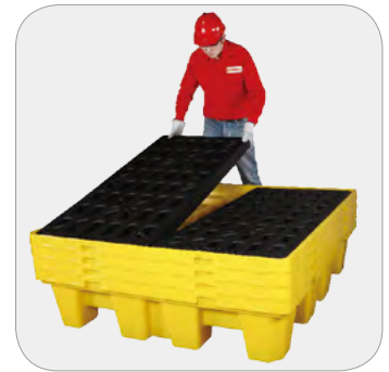
2-drum and 4-drum spill pallets with stackable structure save space and transportation costs