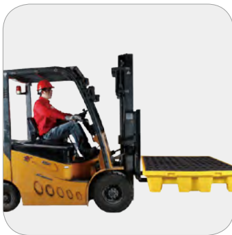
2-drum and 4-drum spill pallets have forklift slots for convenient forklift operation to improve efficiency (*forklift overload prohibited)