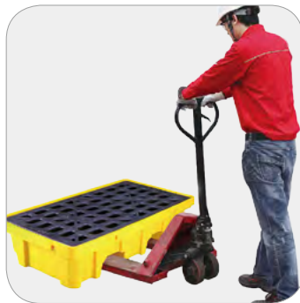
Hydraulic carrying vehicles can also be used to move pallets, which is more convenient