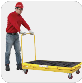
2-drum spill pallets with stackable structure save space and transportation costs