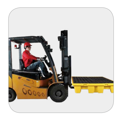
2-drum and 4-drum spill pallets have forklift slots for convenient forklift operation to improve efficiency (*forklift overload prohibited)