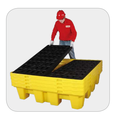
2-drum and 4-drum spill pallets with stackable structure save space and transportation costs