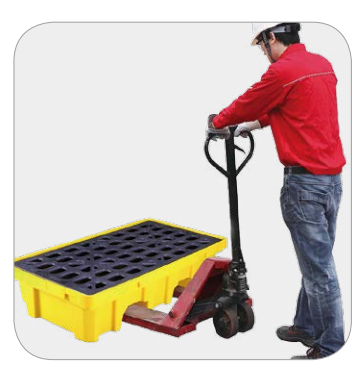
Hydraulic carrying vehicles can also be used to move pallets, which is more convenient