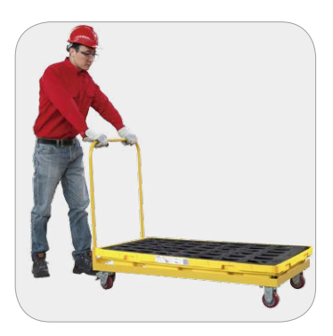
2-drum spill pallets with stackable structure save space and transportation costs