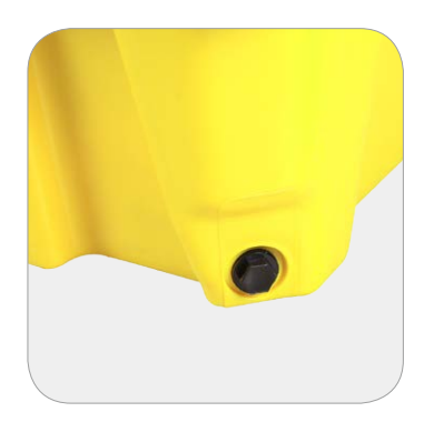
Hexagonal drain plug facilitates drainage