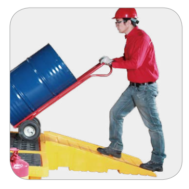
Poly spill pallet ramps make it easier to move large